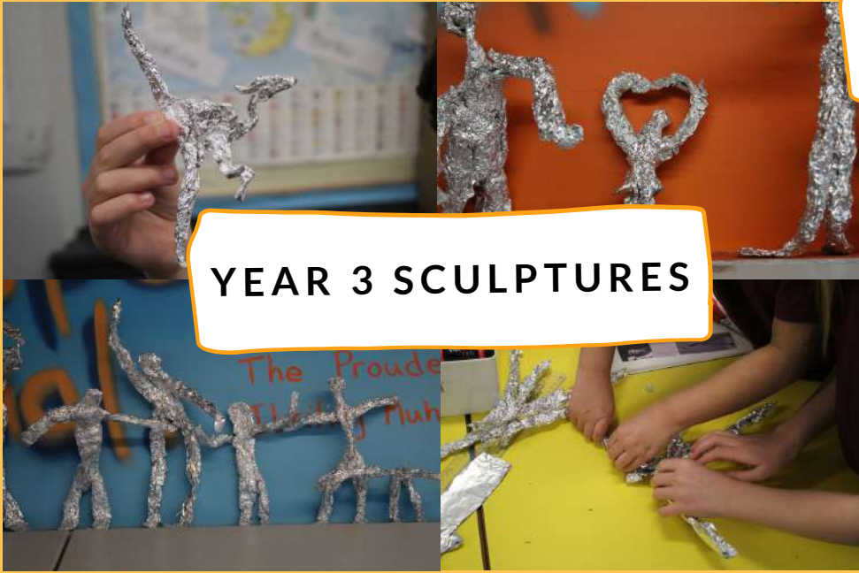
YEAR 3 SCULPTURES