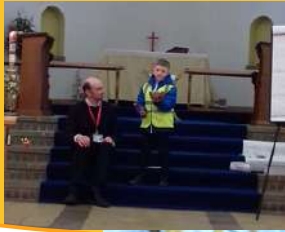
ST HILDA CHURCH VISIT