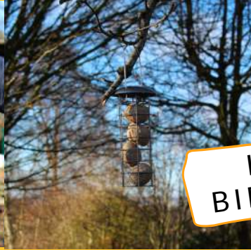
HANGING BIRD FEEDERS